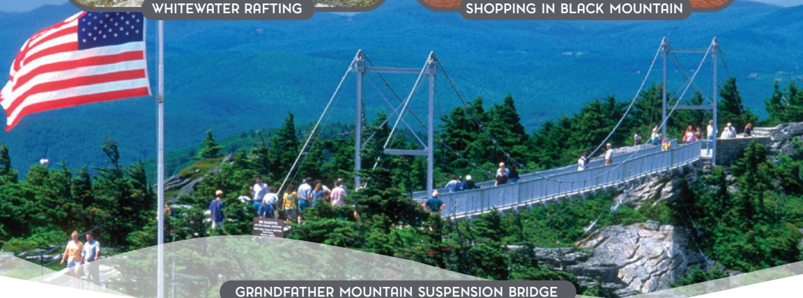
GRANDFATHER MOUNTAIN SUSPENSION BRIDGE